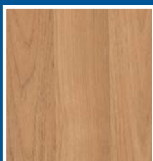
Bristol Gunstock Strip