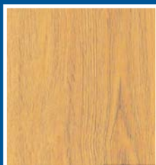
Log Cabin Plank