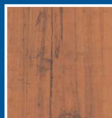
Ozark Distressed Mahogany