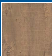
Ozark Distressed Walnut